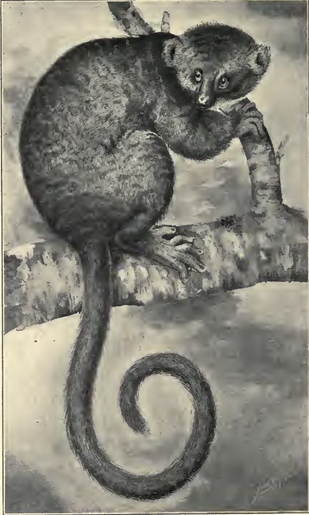
FIG. LXXVII. HAPALOLEMUR GRISEUS. GRAY LEMUR.

1. Adult — P. Madagascar. Ward's Nat. Scien. Establ., Rochester, N. Y.